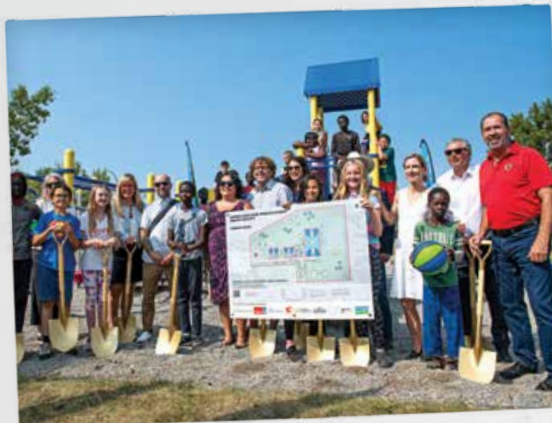
BREAKING GROUND AT GEORGE MOSS PARK