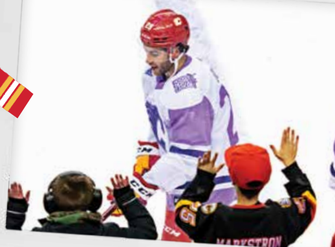
HOCKEY FIGHTS CANCER WARMUP JERSEYS

Flames NHL Hockey Fights Cancer Jersey: proceeds were directed to southern Alberta charities in the fight against cancer.