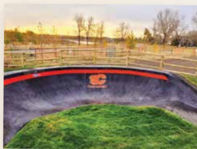
MARDA LOOP PUMP TRACK