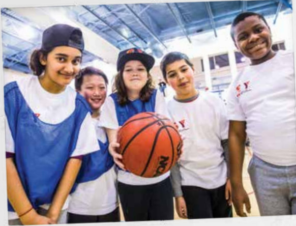
FLAMES YMCA GRADE 6