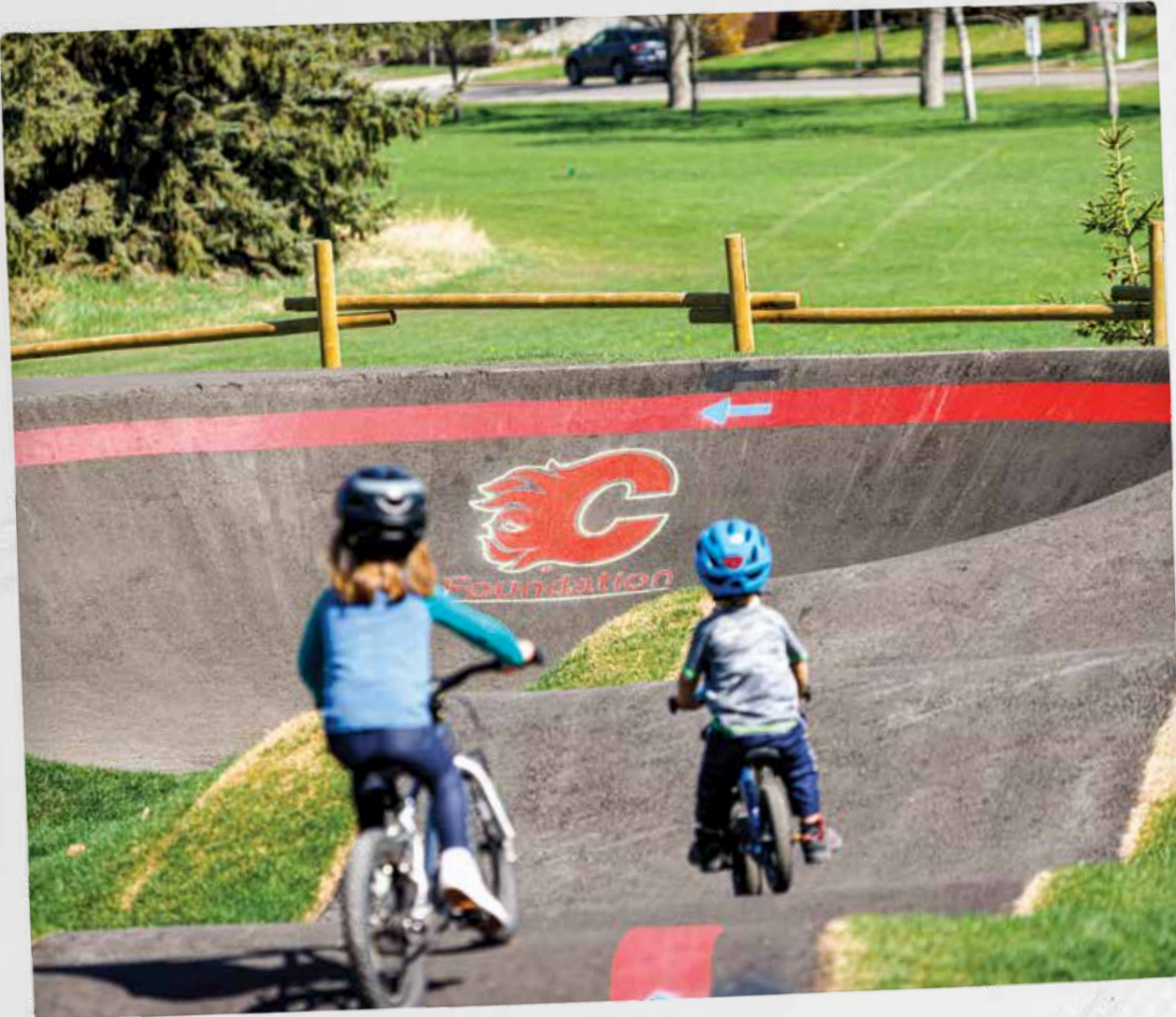
CONFEDERATION PARK PUMP TRACK