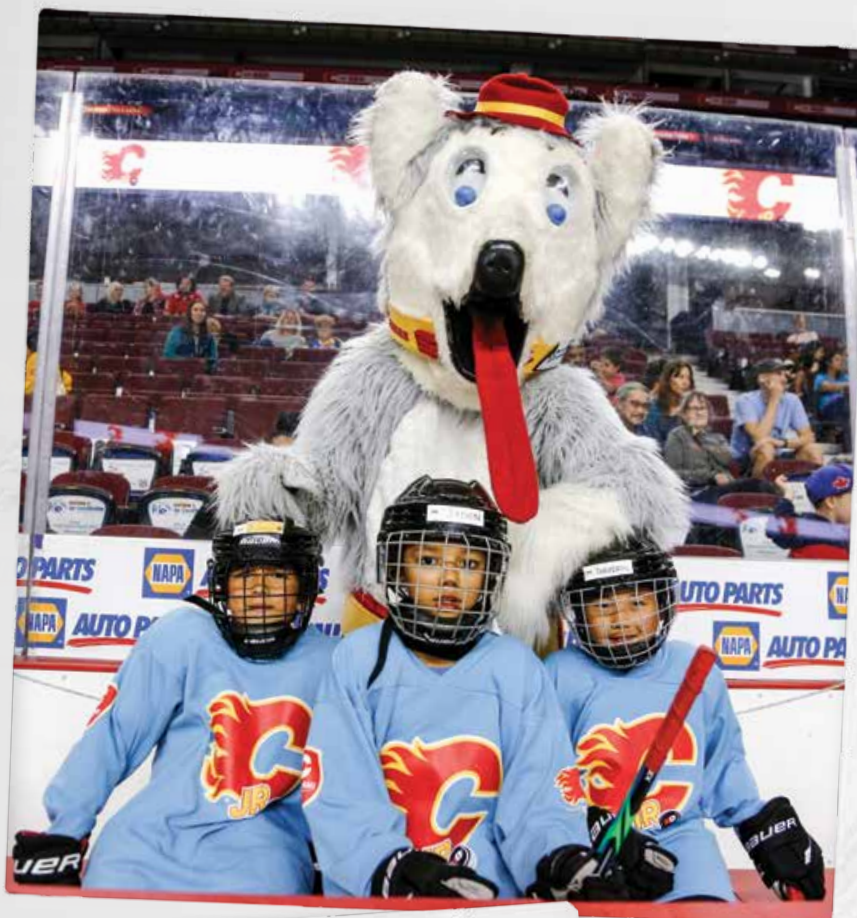
JR. FLAMES PROGRAM