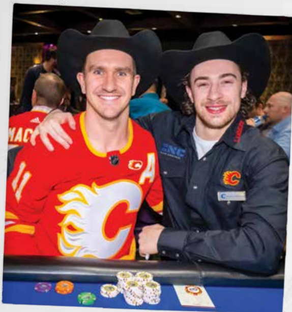
MIKAEL BACKLUND AND ANDREW MANGIAPANE AT THE CALGARY FLAMES CELEBRITY CHARITY POKER TOURNAMENT

This year's event was held at the Deerfoot Inn and Casino with a record attendance of 425 people, we thank you for your support to raise funds for the southern Alberta community.