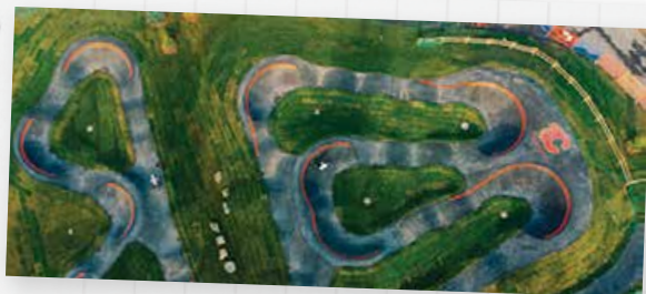
WEST CONFEDERATION PARK PUMP TRACK