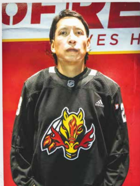
FLAMES INDIGENOUS CELEBRATION JERSEY

Flames NHL Hockey Fights Cancer Jersey: proceeds were directed to southern Alberta charities in the fight against cancer.