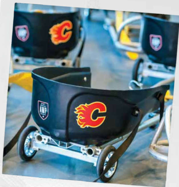
PX3 ROLLER SLED PROGRAM

150+ youth from the Kids Cancer Care Foundation and the Calgary Police Foundation attended