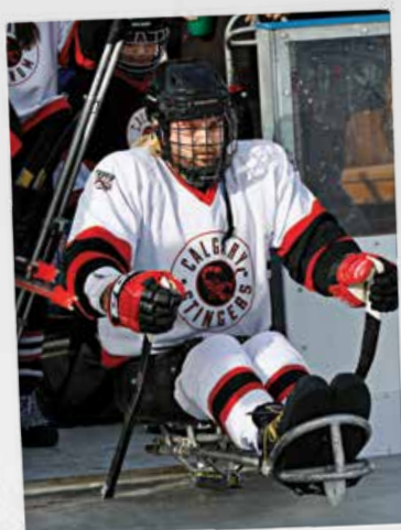
PARKDALE ACCESSIBLE ODR