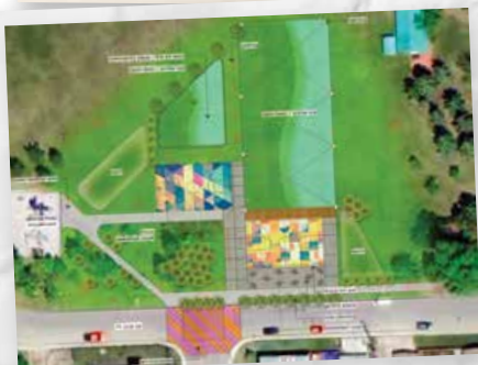
GEORGE MOSS PARK REVITALIZATION