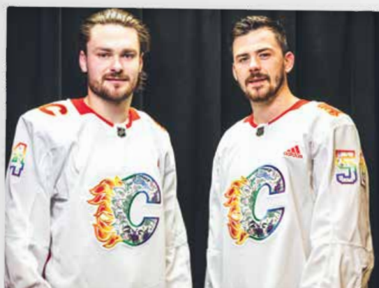
FLAMES PRIDE CELEBRATION JERSEYS

Flames Indigenous Celebration Jersey: designed with Chiefs and Representatives from the Treaty 7 First Nations, proceeds benefited local programming in all 7 nations.