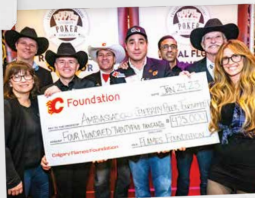
CHEQUE PRESENTATION AT THE CALGARY FLAMES CELEBRITY CHARITY POKER TOURNAMENT