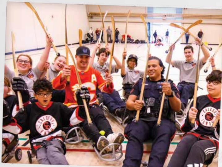
PX3 ROLLER SLED PROGRAM