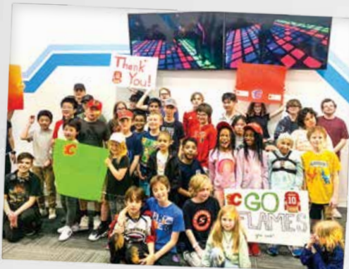
KIDS CANCER CARE PEER PROGRAM + CAMP KINDLE