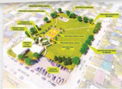
FOREST LAWN PARK REVITALIZATION