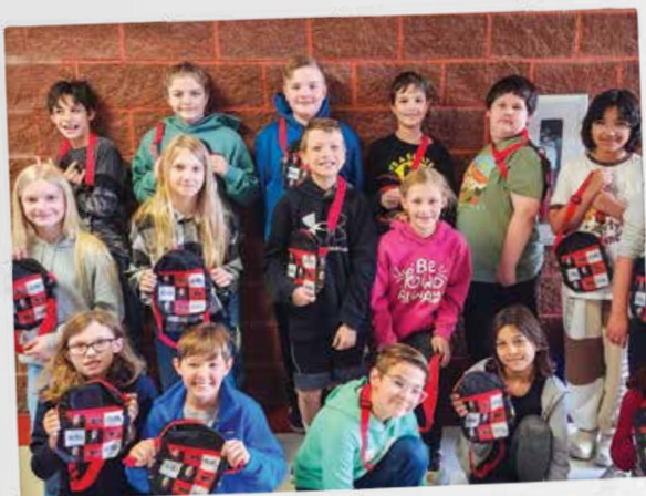
HOCKEY ALBERTA FOUNDATION EVERY KID EVERY COMMUNITY