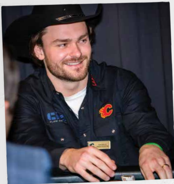
RASMUS ANDERSSON AT THE CALGARY FLAMES CELEBRITY CHARITY POKER TOURNAMENT