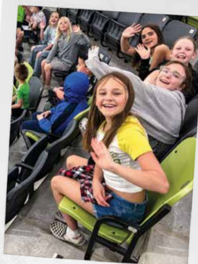
HOCKEY ALBERTA FOUNDATION EVERY KID EVERY COMMUNITY