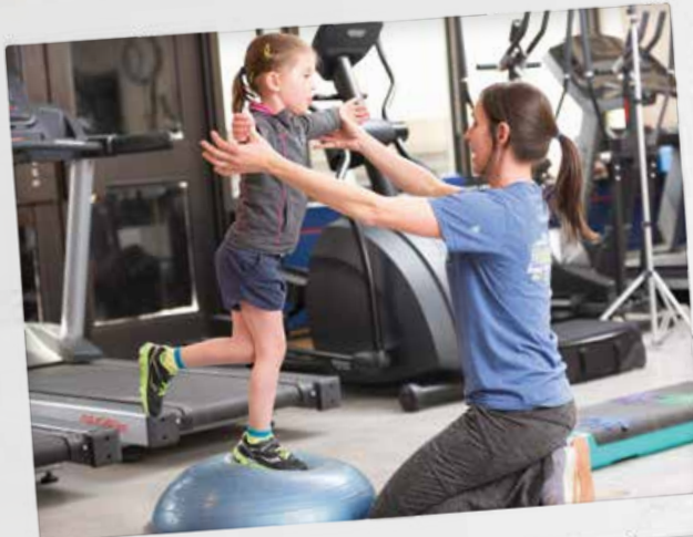
KIDS CANCER CARE PEER PROGRAM