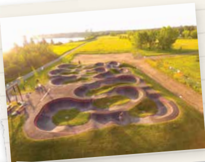
SOUTH GLENMORE PARK PUMP TRACK