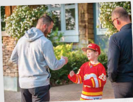
FLAMES COMMUNITY EVENT

2022-23 CALGARY FLAMES FOUNDATION IMPACT REPORT PUBLISHED BY CALGARY SPORTS AND ENTERTAINMENT CORPORATION