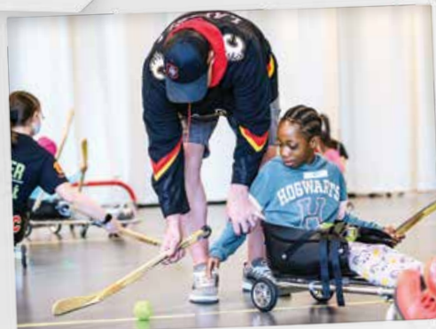
PX3 ROLLER-SLED PROGRAM

In partnership with the PX3 AMP Flames Hockey team, the Flames PX3 Roller-Sled program is dedicated to educating and empowering the community on the power of adaptive sports and activities for individuals with physical disabilities.