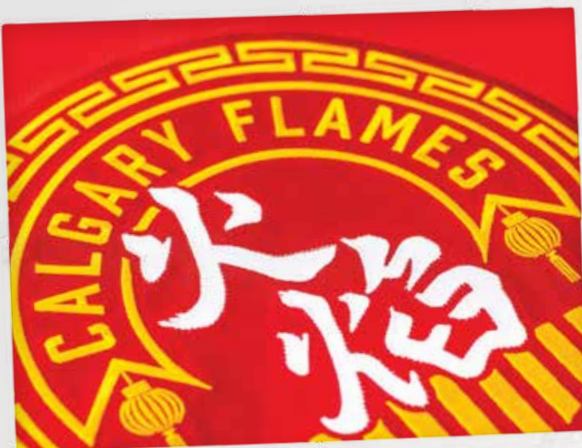
LUNAR NEW YEAR JERSEY CREST